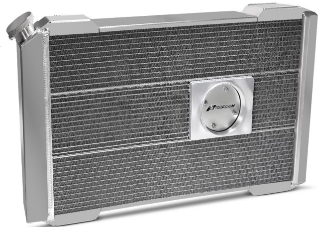
LS Conversion Systems